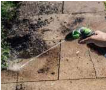
Ideal for cleaning