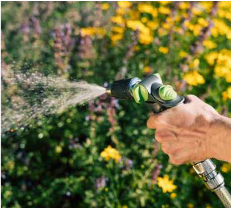
Pleasant feel and non-slip thanks to soft grip