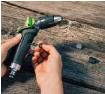
Easy clean and repair